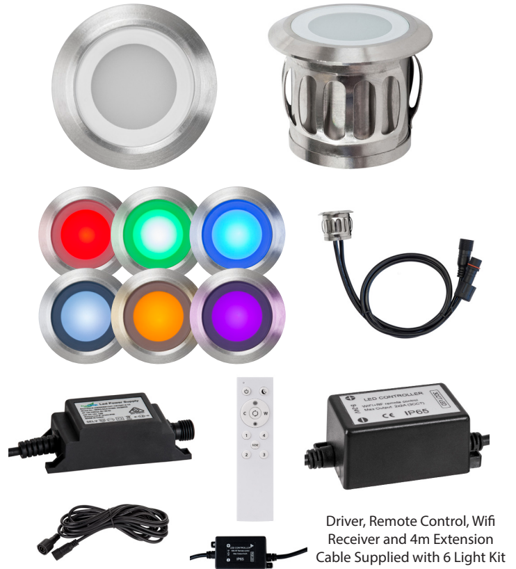
Driver, Remote Control, Wifi Receiver and 4m Extension Cable Supplied with 6 Light Kit