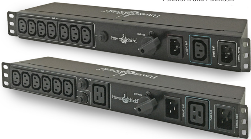
PSMBS2K and PSMBS3K