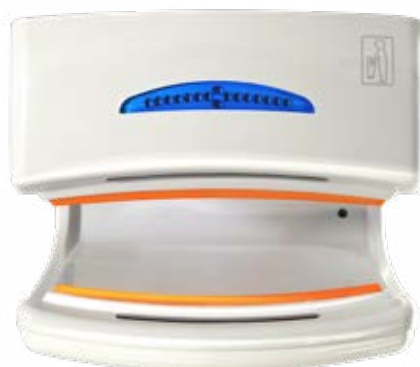
Top View (White Model)